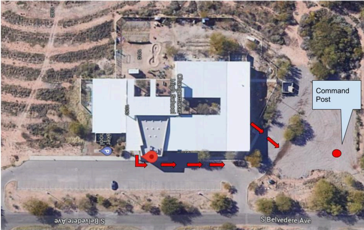
Tucson Campus Evacuation Map

The Incident Command Post (ICP) is the location from which the Incident Commander oversees all incident operations. There is generally only one ICP for each incident, but it may change locations during the event. Every incident must have some form of an (ICP) (See Campus Evacuation Map)