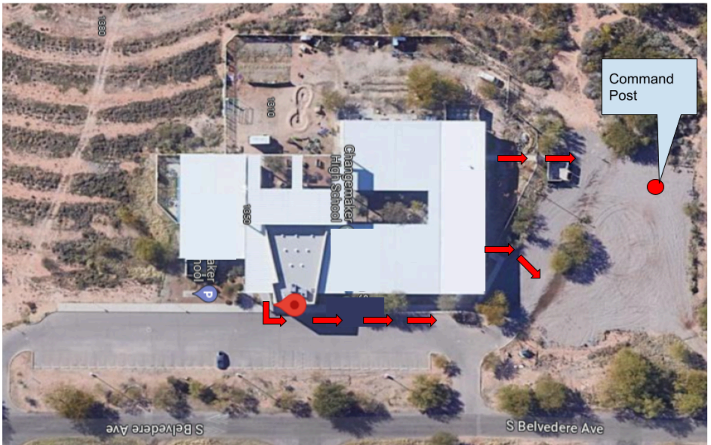
Tucson Campus Evacuation Map

The Incident Command Post (ICP) is the location from which the Incident Commander oversees all incident operations. There is generally only one ICP for each incident, but it may change locations during the event. Every incident must have some form of an (ICP) (See Campus Evacuation Map)